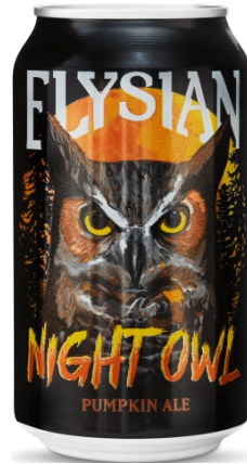
ELYSIAN NIGHT OWL PUMPKIN ALE