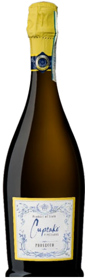
CUPCAKE VINEYARDS PROSECCO*