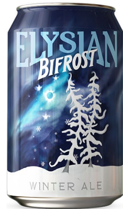
ELYSIAN BIRFROST WINTER PALE ALE