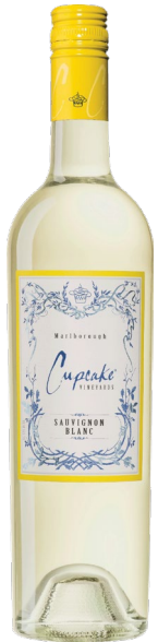
CUPCAKE VINEYARDS SAUVIGNON BLANC*