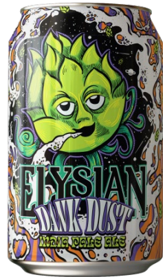
ELYSIAN DANK DUST INDIA PALE ALE