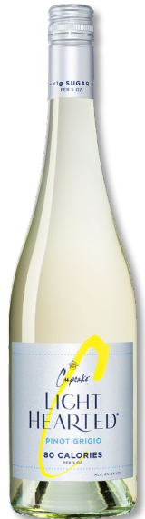
CUPCAKE VINEYARDS LIGHTHEARTED PINOT GRIGIO*