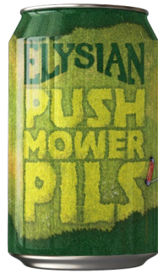
ELYSIAN PUSH MOWER PILS AMERICAN-STYLE PILSNER