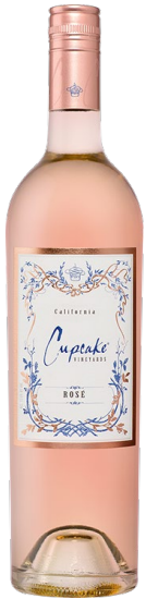
CUPCAKE VINEYARDS ROSÉ*