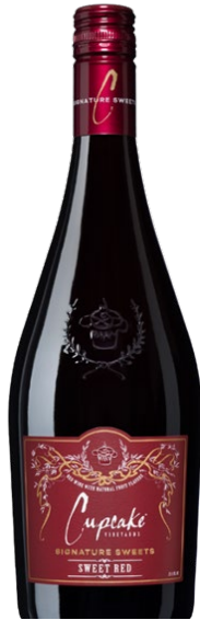
CUPCAKE VINEYARDS SWEET RED*